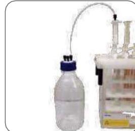
Large Volume Samplers